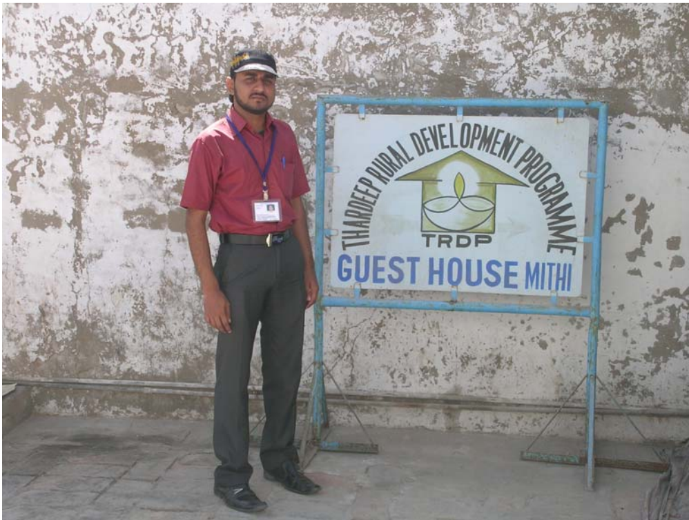
Arrival at TRDP Guest House Mithi 8 th April 2010

Below are few images which were taken during visit.