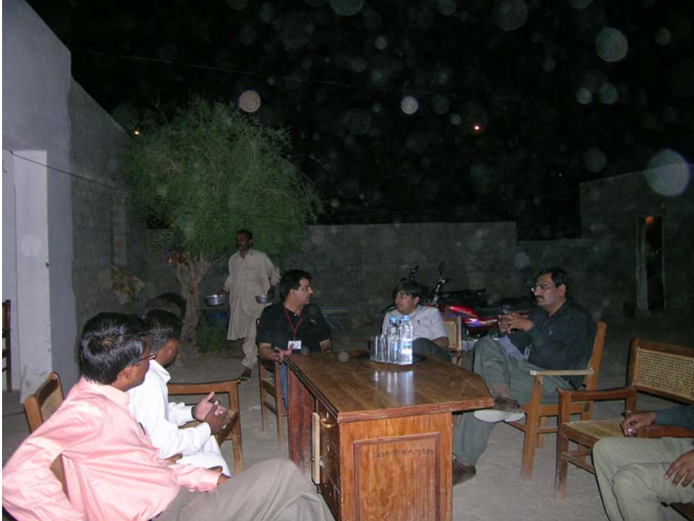
Regional office TRDP at Nnagarparker