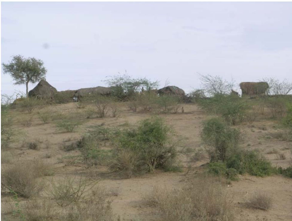
A view of Tharparker