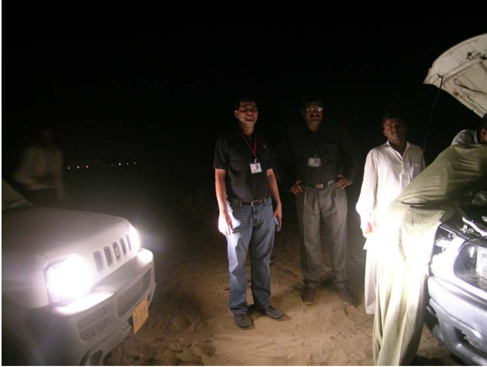
A night view of desert. Lights installed on fence at Indian border are clearly visible in background.