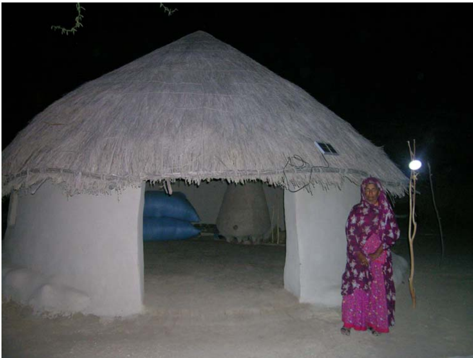
A traditional Tharparker Hut with a Solar Lantern Installed.