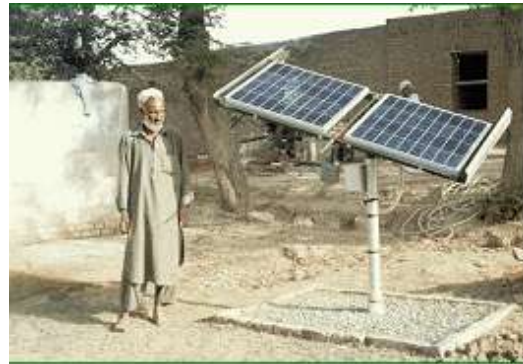
Solar panels with sun tracking system

The pump along with sun track rack is installed at Community organization Hattar of Fateh jang tehsil of Attock district in a well. The water table in the well is at about 45 feet. The pump is placed at 60 feet. The output of the pump is about 1500 gallons per day. A water reservoir has also been constructed to collect water. The collected water is used for irrigating the fields and for drinking purposes.