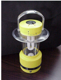
LED fitted lantern