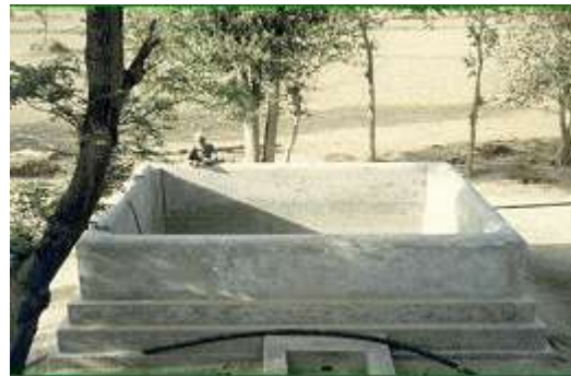
Storage tank for solar pump