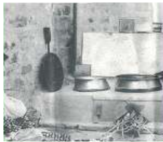
Fuel Efficient Stove