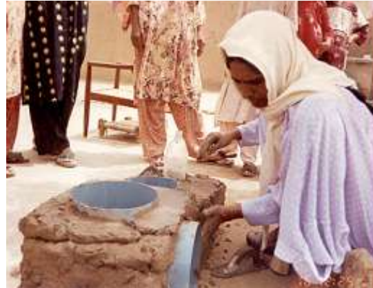
Fuel Efficient Stove making

Fifty molds of Fuel-efficient stoves were prepared and provided to the Field units of NRSP. The communities were trained for its use. The communities are using the stove molds for constructing Fuel-efficient stoves. Some of the females have started it as an enterprise and are selling the stoves.