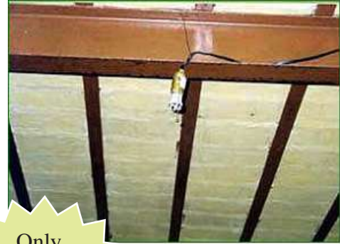
LED fitted on a roof

Systems of two and four LED bulbs (capacity: 1 Watt) and solar panels of 6 and 15 Watts capacity respectively are being installed at different regions of NRSP.